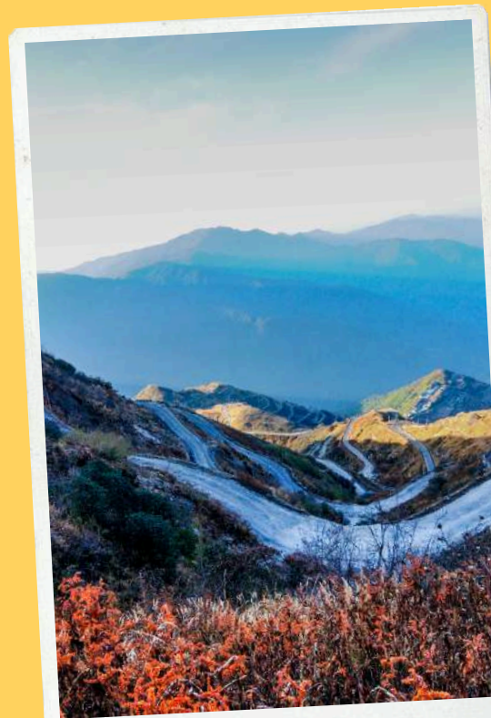
THE ANCIENT ROUTE